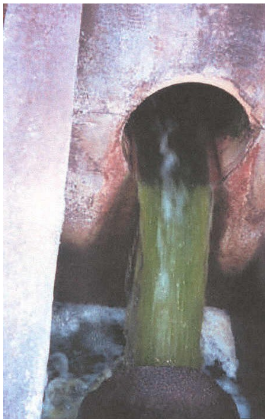
Foto 39 - Efluente do esgoto tratado da ETE Samambaia.