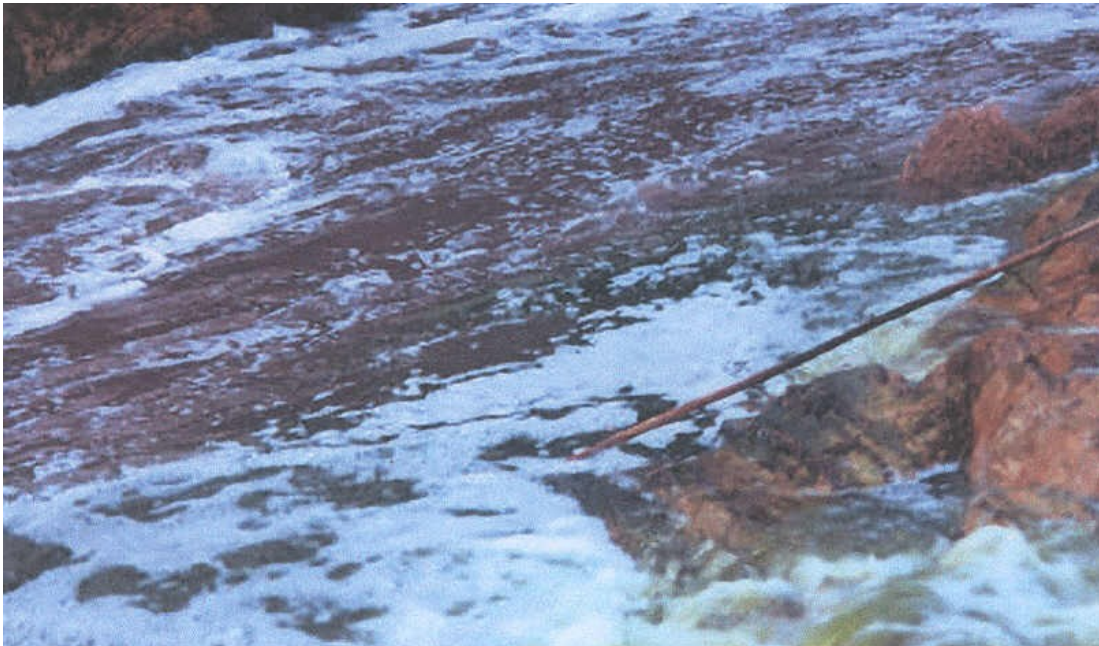
Foto 38 - Ponto de mistura do efluente da ETE Samambaia com o rio Melchior