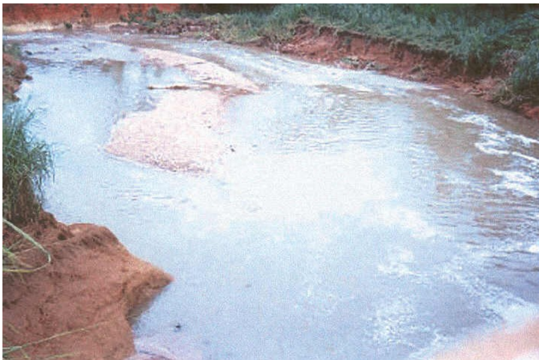
Foto 41 – Rio Melchior logo a montante do ponto de amostragem MC01, visto da ponte na DF-180.